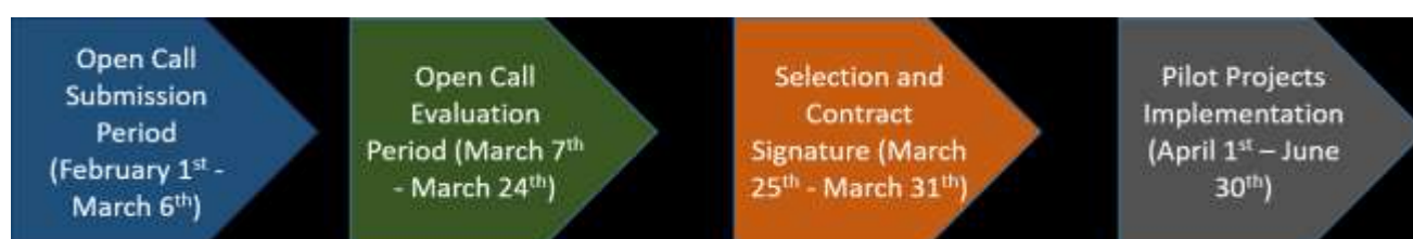
Figure 2. Open call timeline

Below is the presentation of the distribution of the call along the project timeline.